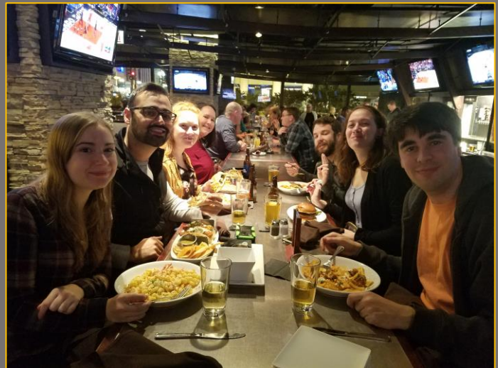
Graduate students enjoying a meal out in Chicago at the ISTSS conference