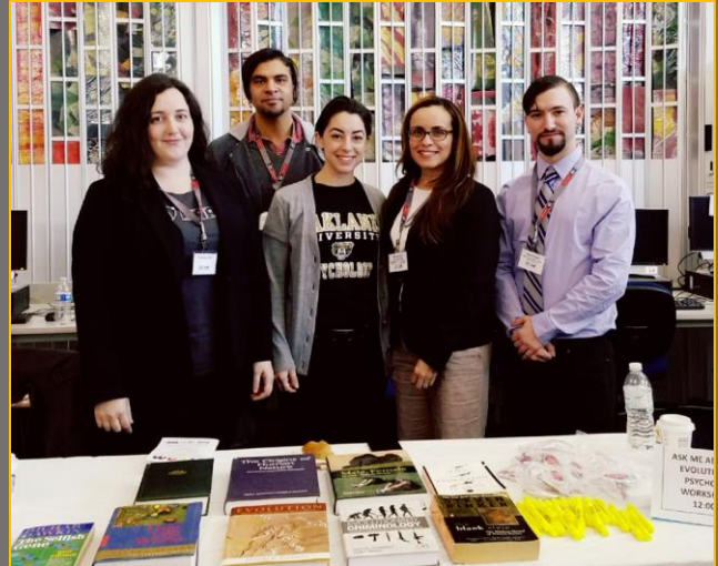
OU Psychology Graduate students provide advice for students interested in pursuing a career in evolutionary psychology at the STEAM career fair