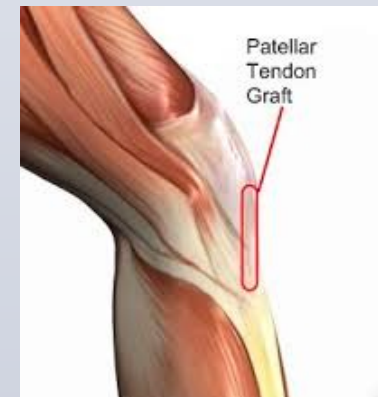
Figure 3: Illustration of BTB autograft in ACL reconstruction