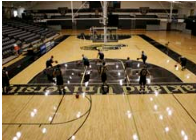
Oakland jumped to NCAA Division I athletics in 1998, but its biggest boon came after the men's basketball team made the '05 tournament.