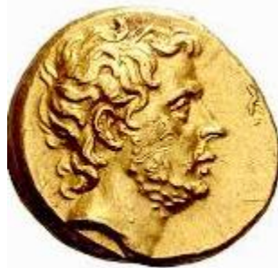
Figure 2. Gold Starter Coin of Flaminius 197 BCE.

The concept of the imperial cult came to Rome from the Greek East. Divine cult was first offered to the Hellenistic kings of Asia Minor in the late fifth, early fourth centuries BCE (Price, 1986, p.26). As Rome expanded east, victorious generals were exposed to the concept of worshipping living rulers as gods. Though it would never have been accepted in the Late Roman Republic, some generals allowed honors associated with the imperial cult to be bestowed upon them in the Greek world (Kleiner, 2010, p. 48). An example of this can be seen in the gold starter coin issued by Titus Quinctius Flaminius in 197 BCE bearing his portrait head (Figure 2) During this period, Roman policy prohibited the portrayal of living people on their currency which could only bear images of deities, personifications, or heroes (Kleiner, 2010, p. 48). By 191 BCE, there was an established cult to Flaminius in Greece, where he was hailed as soter , “savior”, in Chalcis, Corinth, and Argos (Kleiner, 2010, p. 97).