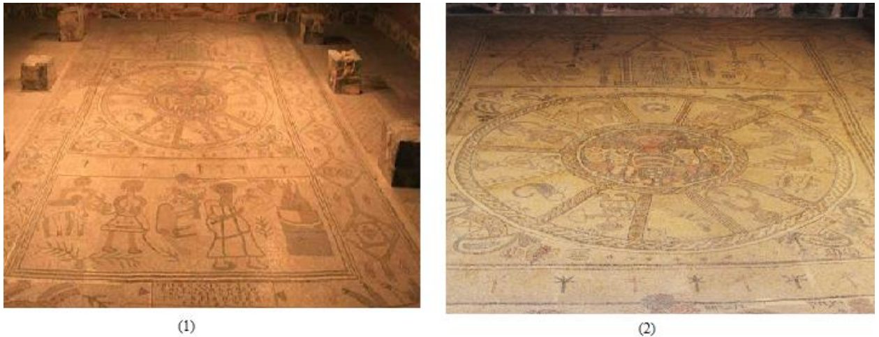
Figure 8. Bet Alpha Synagogue, polychrome mosaic floor, 6 th century CE (1) Overview of Bet Alpha mosaic floor. (2) Detail of Sol and the zodiac from Bet Alpha mosaic. Photos taken June 2014 by Elena Durnbaugh

figures are two-dimensional and static, presented frontally, with little attempt to represent realistic body proportions. Yet, while artistically naïve, the archaeological preservation is paramount (Figure 8-1).