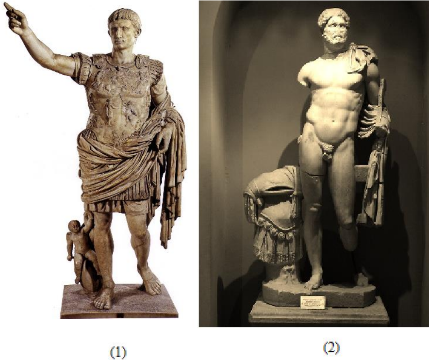
Figure 3. The Emperor as Divine (1) Augustus as Imperator from Prima Porta, marble, c. 20 BCE; divine attributes include the emperor's bare feet, the dolphin and the cupid supporting the statue connecting him to Venus, and the cosmological setting of the scene depicted on the cuirass. Retrieved February 26, 2015 from https://verbasapientiae.pbworks.com/f/1208925884/roman_augustus2.jpg (2) Hadrian from Pergamum, marble, principate of Hadrian; the emperor is portrayed naked, a symbol of divinity in Classical sculpture. Retrieved February 26, 2015 from http://www.gotourturkey.com/wp-content/uploads/2013/07/Hadrian-Bergama.jpg