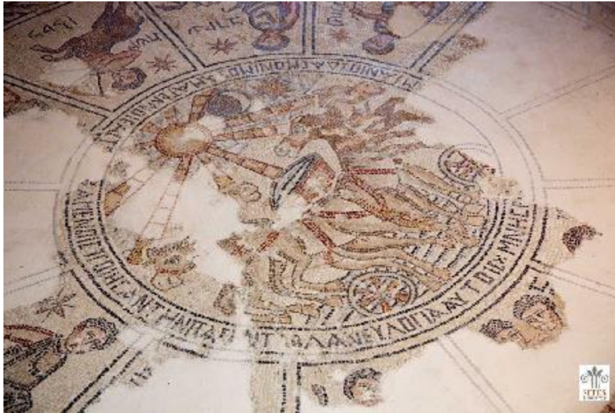
Figure 7. Detail of panel depicting Sol and the zodiac from Sepphoris, polychrome mosaic, 5 th century CE. Retrieved February 26, 2015 from http://carta-jerusalem.com/wp-content/uploads/2012/05/Zippori-synagogue-floor-mosaic8.jpg

The final synagogue to be examined is Bet Alpha. Located in the Jezreel Valley, the Bet Alpha synagogue was excavated in 1929 by Eleazar Sukenik on behalf of Hebrew University (Levine, 2012, p. 280). Unlike Tiberias and Sepphoris, next to nothing is known of Bet Alpha apart from the information provided by archaeological excavation. Taken together with numismatic evidence, the Greek inscription found near the entrance to the central nave dates the synagogue to the early sixth century (Levine, 2012, p. 281). Bet Alpha was constructed according to a typical Byzantine basilica plan, with a courtyard, narthex, and hall divided into a nave with two side aisles by two rows of pillars. Oriented north to south, the structure faced Jerusalem (Levine, 2012, p. 280). Like at Tiberias, the Bet Alpha mosaic floor is divided into three panels, which presented following the orientation of the building, are as follows: (1) a scene depicting the Binding of Isaac; (2) the zodiac cycle framing a depiction of Sol; and finally (3) a Torah shrine flanked by menorahs, shofars, and other Jewish symbols and ritual items. The artistic depictions are executed with far less skill than those of Tiberias and Sepphoris. The