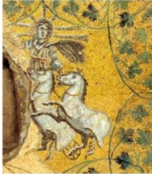
Figure 9. Tomb of the Julii Christ as Sol Invictus, polychrome mosaic, 3 rd Century CE.

Yet another example of Christ depicted as Sol is found on the Sarcophagus from la Gayolle. This sarcophagus, found in southern France, also dates to the third century. The depiction of Sol Invictus is interpreted to represent Christ based on its concurrence with other commonly used Christian motifs on the sarcophagus. The relief shows a frontal bust of Sol, identified by his raiment and the rays that surround him, to the left and above a baptism scene (Huskinson, 1974, p.79). Though the identity of the figure said to represent Sol is debated amongst scholars, due to the similarity of attributes and the location of the figure situated above the baptism scene, it does not seem implausible that this should correctly be identified as Sol representing Christ.