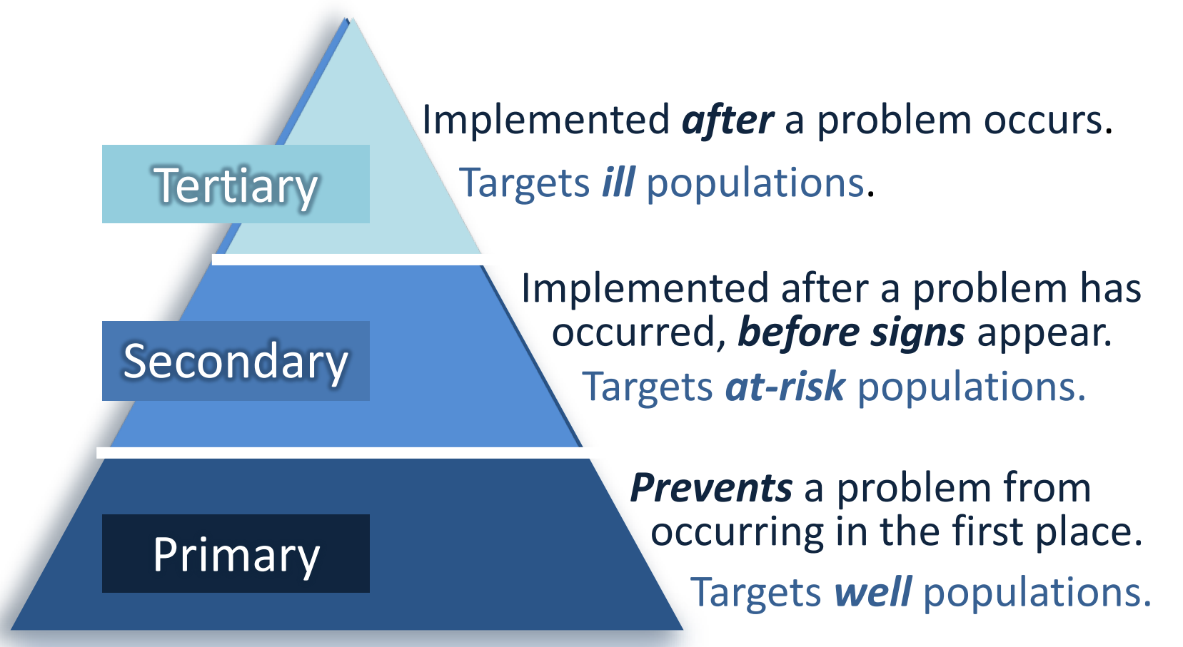
Figure 1: Prevention strategies. Workshop participants were encouraged to think about this prevention model when sharing their ideas for wellness promotion.

Before matriculating, medical students have lower rates of burnout and higher quality of life compared to sameage peers<sup>1</sup>. However, once in medical school, students experience more burnout than their non-medical student counterparts. Medical schools have sought to address trainee burnout by adding sessions on resilience and stress management, but these secondary or tertiary interventions are often met with pushback<sup>2</sup> (Fig. 1). Instead, focus is shifting to the curriculum structure itself, with students and educators looking to system-level changes that foster wellness from within the learning environment<sup>3</sup>.