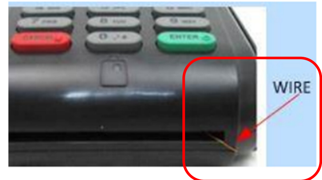
Wire to the smart-card slot

The Smartphone next the Credit Card terminal has an app installed allowing the phone to capture your credit card information.