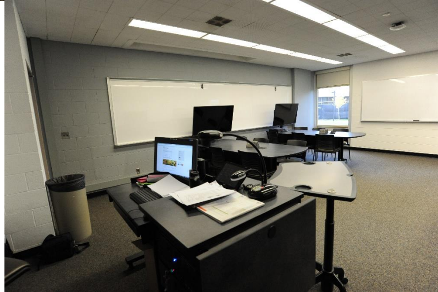
Whiteboards on 3 walls