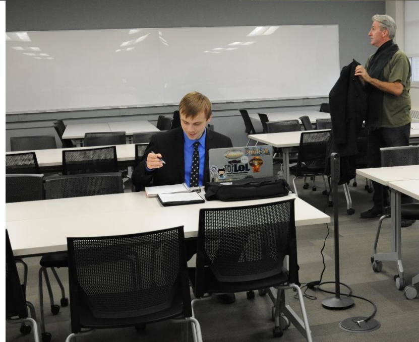
Whiteboards on 4 walls AC Power to center of room