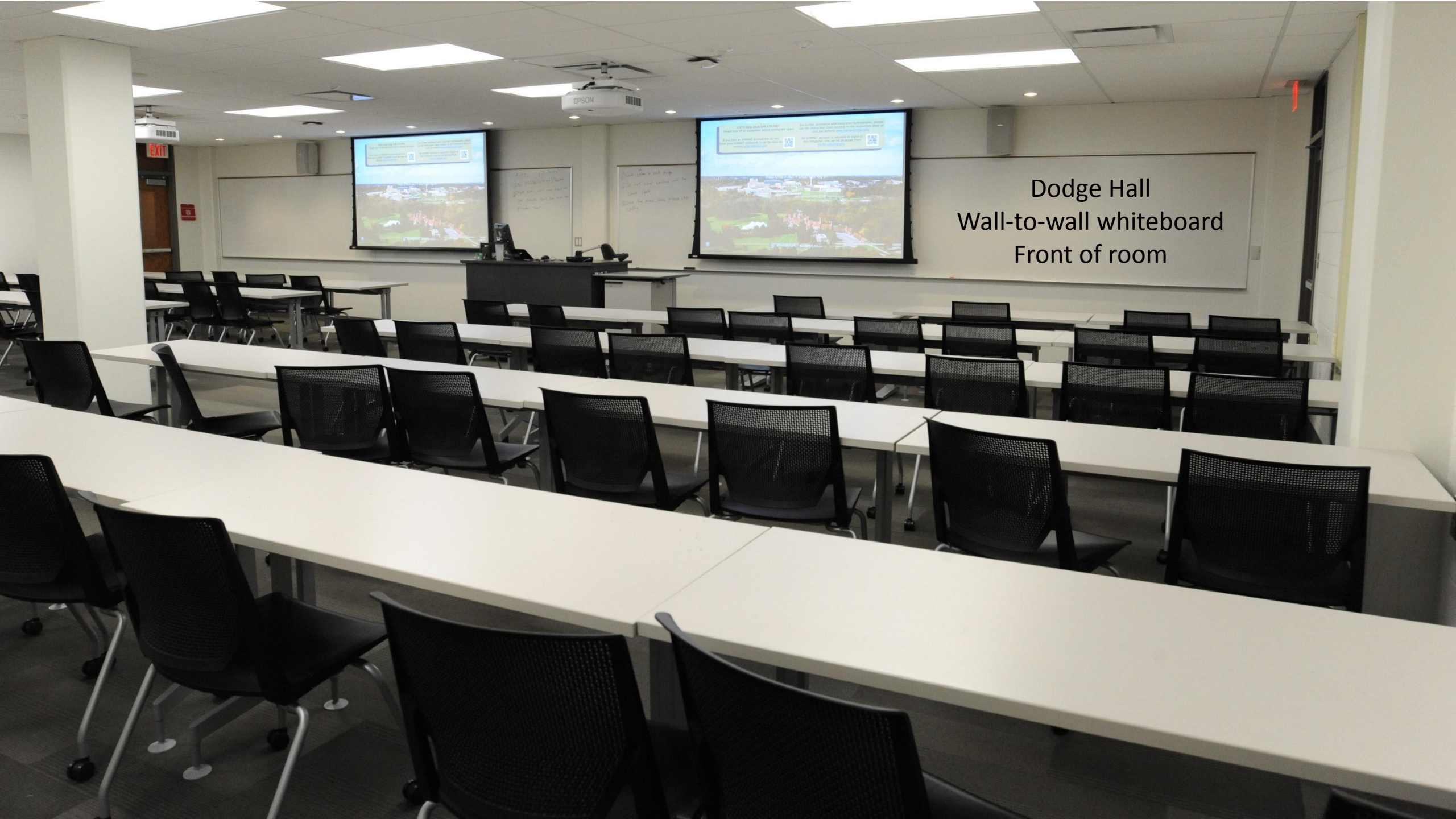
Dodge Hall Wall-to-wall whiteboard Front of room