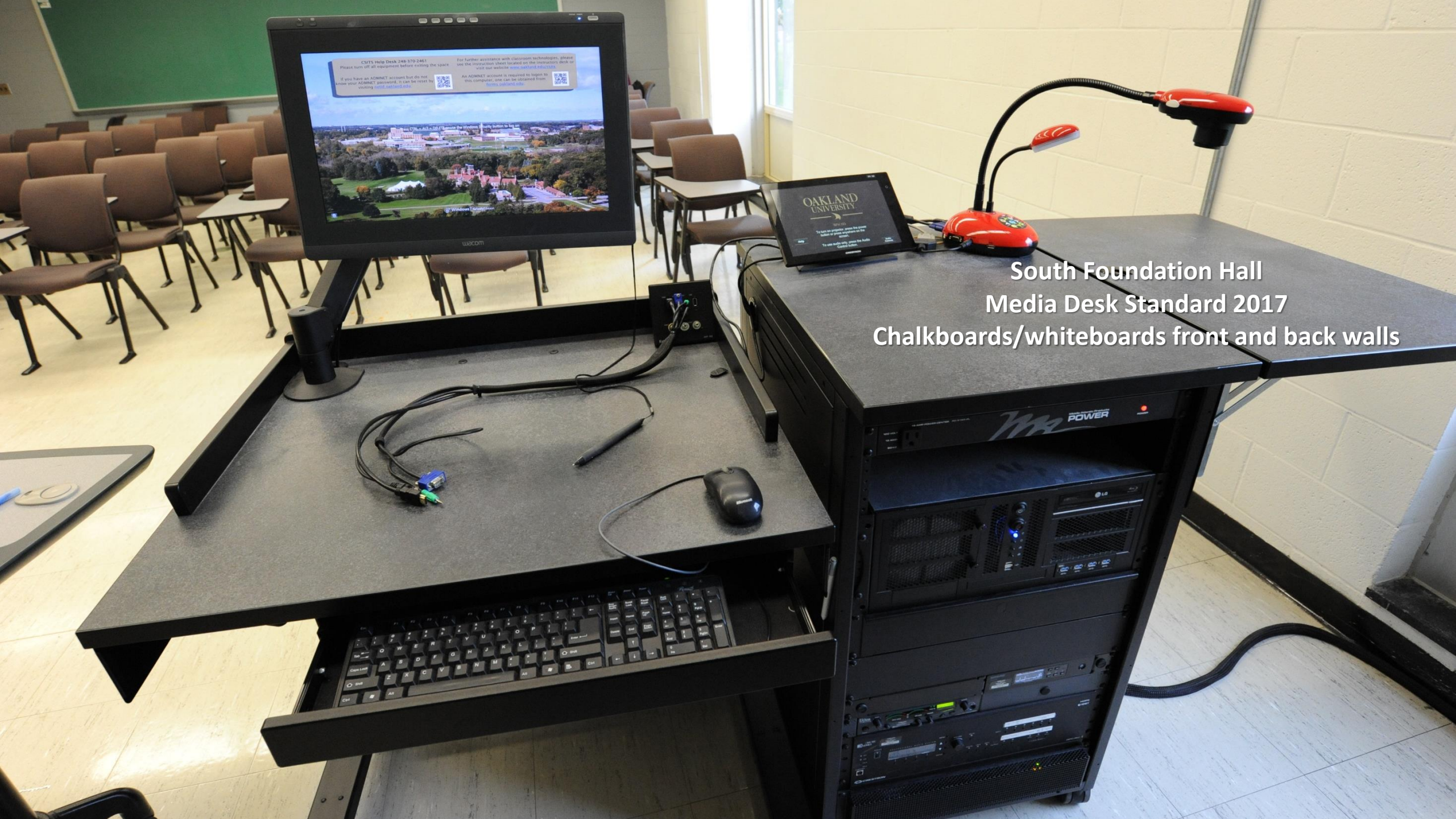
South Foundation Hall Media Desk Standard 2017 Chalkboards/whiteboards front and back walls