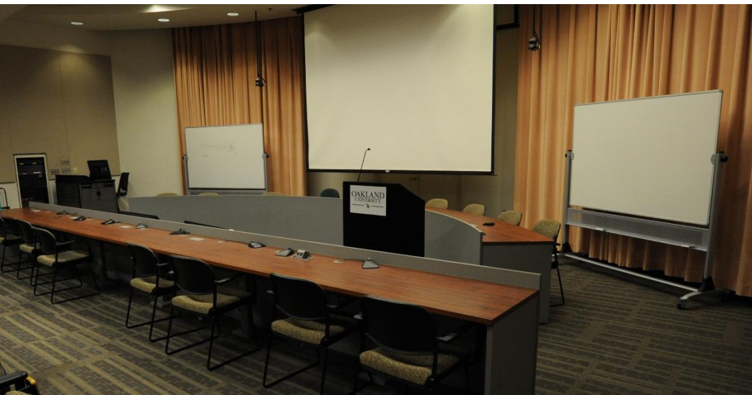
Elliott Hall Auditorium