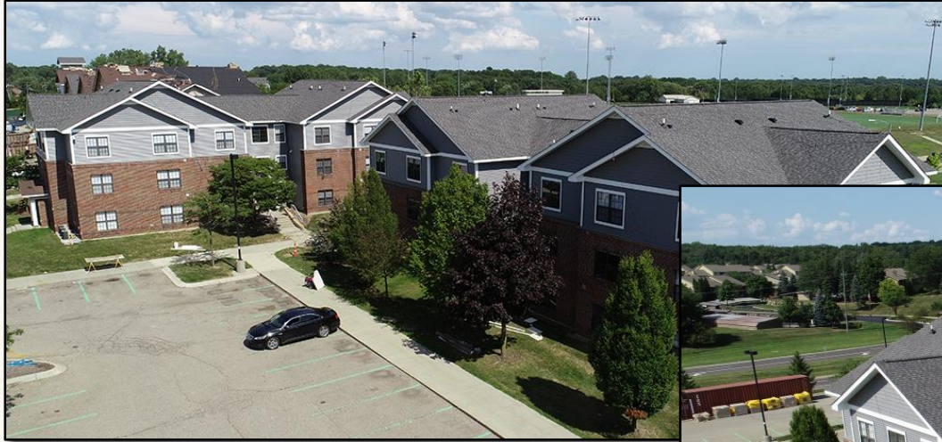
Ann V. Nicholson Student Apartments facelift project