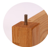
Bed Post Pin

Make sure to place safety pins in each side of the furniture and align with the holes of the top frame.