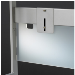
• SmartBar with universal Mount Bracket