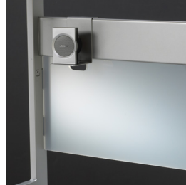
• SmartBar™ with Speaker Stand

Welcome! Meet the next generation of tech friendly furniture.