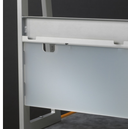
• Wire management behind SmartBar